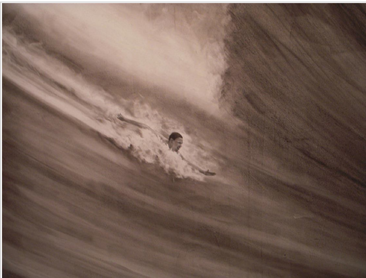
Phillip Adams' charcoal mural of President Obama caught in a tidal wave

Posted Apr. 14, 2009 | Comments: 1 | Add Comment